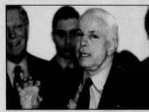
ON THE HILL: Sen. John McCain, R-Ariz., addresses a Capitol Hill news conference Thursday to discuss the campaign finance reform legislation now before the Senate.

Republican critics argue the bill is unconstitutional as well as biased in favor of Democrats.